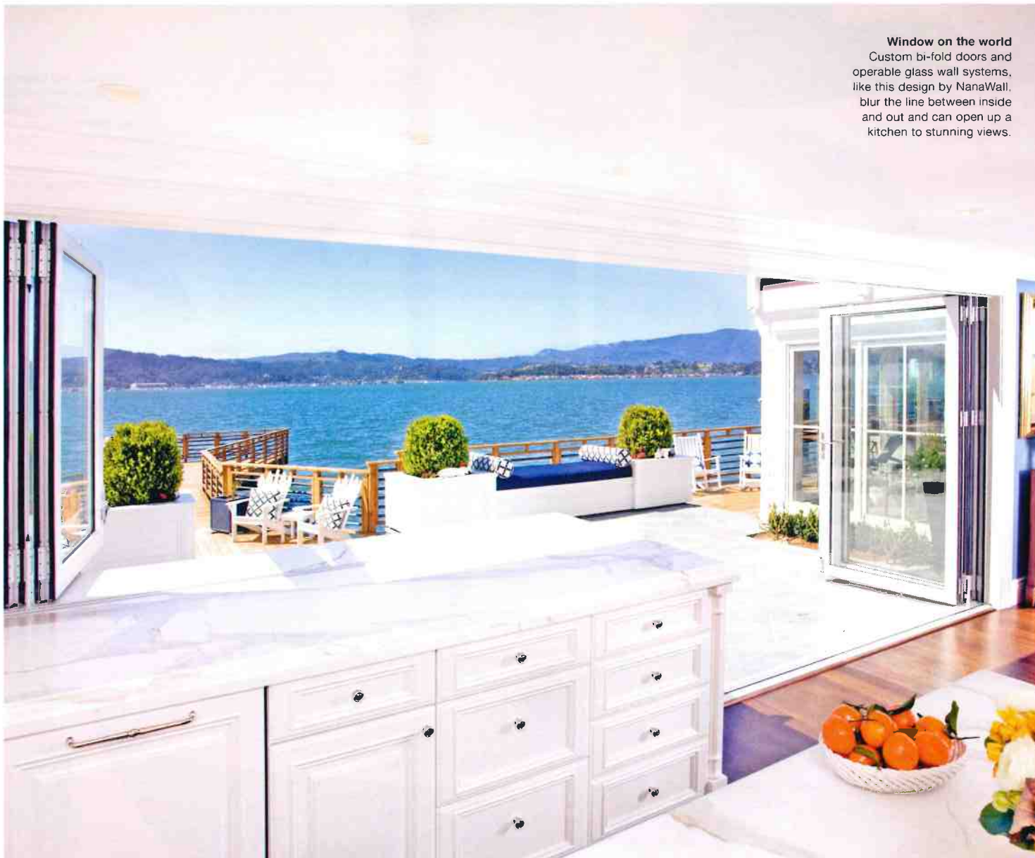
Window on the world Custom bi-fold doors and operable glass wall systems, like this design by NanaWall, blur the line between inside and out and can open up a kitchen to stunning views.